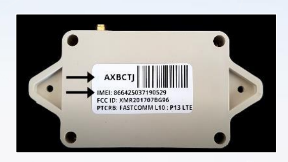
5. Capture AgentID and IMEI