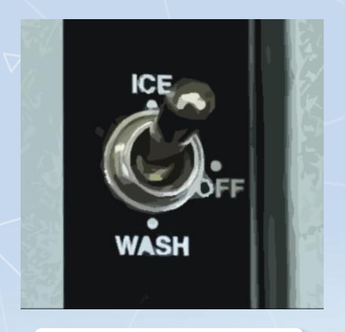
1. Turn Power OFF