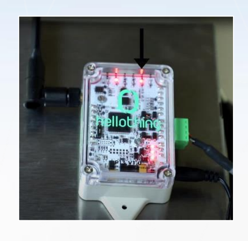
4. Power On; Ensure comm LED is lit.